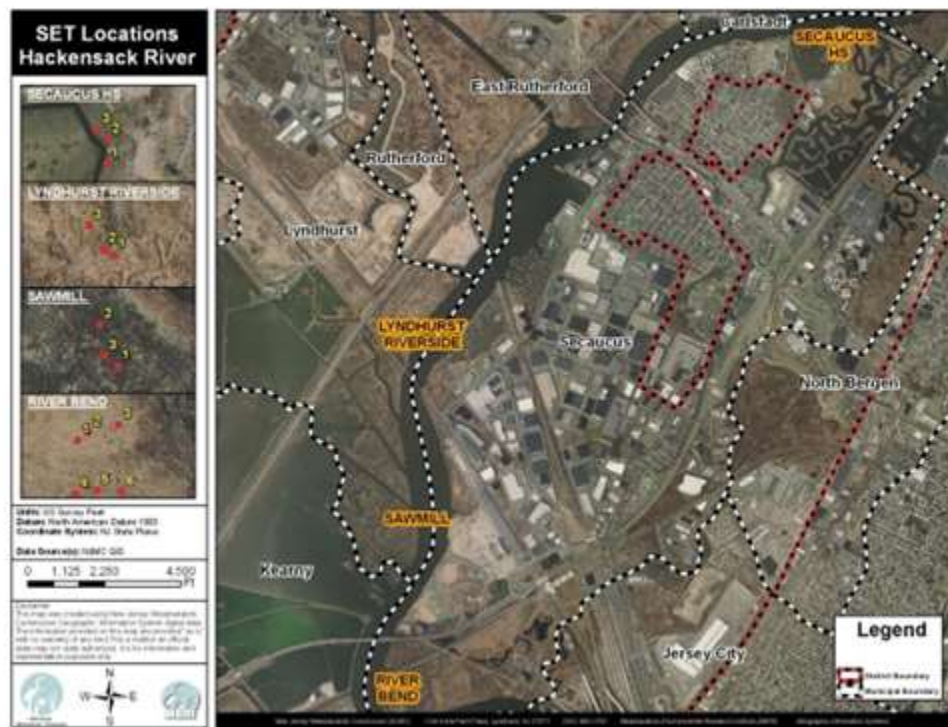
Figure 1: Location of the SET sites

Sediment Elevation Tables (SET) provide a constant plane in space from which the change in marsh surface elevation can be measured. Benchmark rods and marker horizons of feldspar were established at five sites in the lower Hackensack River Meadowlands during August of 2008. The five sites being monitored are Riverbend High Marsh (RBH), Riverbend Mixed Marsh (RBM), Sawmill (SM), Lyndhurst Riverside (LR), and Secaucus High School (SHS). Each site is measured annually, except in the year 2009. This Report is a summary of the marsh elevation change up to today. (Fall 2023)