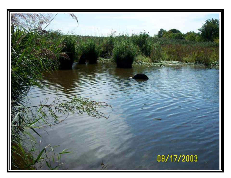
Photo 14: View facing south showing Kearny Freshwater Marsh Sampling Site KM-SD-002.