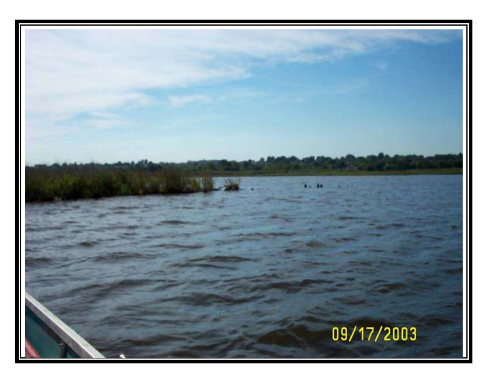
Photo 16: View facing west showing open water at Kearny Freshwater Marsh.