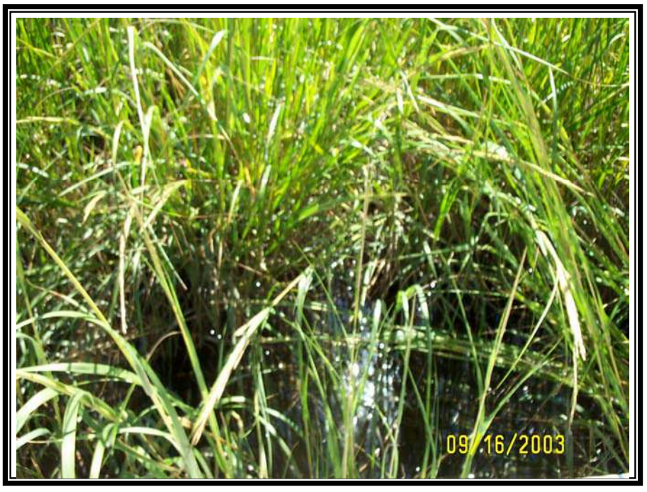
Photo 2: View showing vegetation type along shoreline near sample site SAW-SD-001. Shoreline vegetation consists of smooth cordgrass ( Spartina alterniflora ).