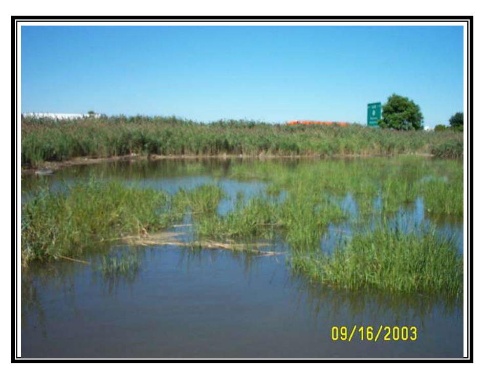
Photo 3: View facing west showing Sawmill Wildlife Management Area with a shoreline dominated by Phragmites and a marsh dotted with Spartina alterniflora .