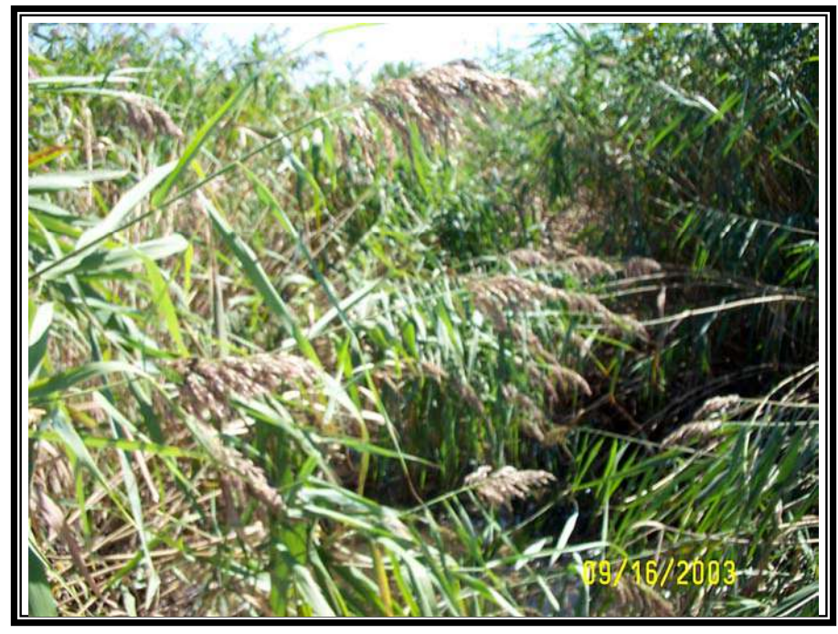
Photo 4: View facing east showing the interior of the Secaucus High School Marsh with thickly growing Phragmites .