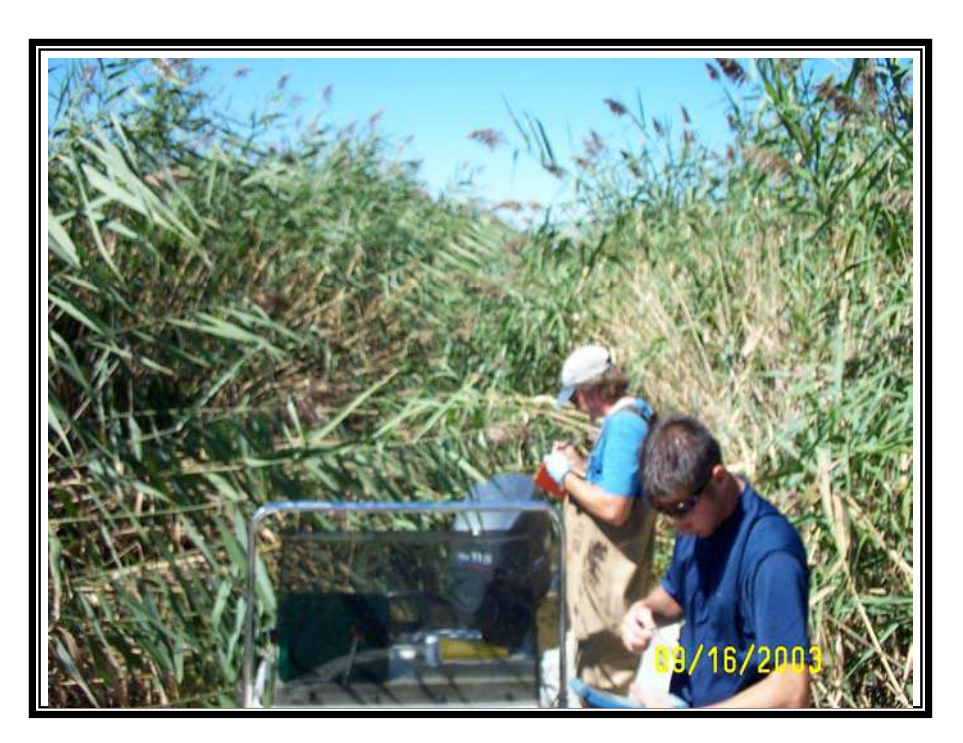
Photo 5: View facing west showing the 21' privateer in the main channel surrounded by the dominant Phragmites .