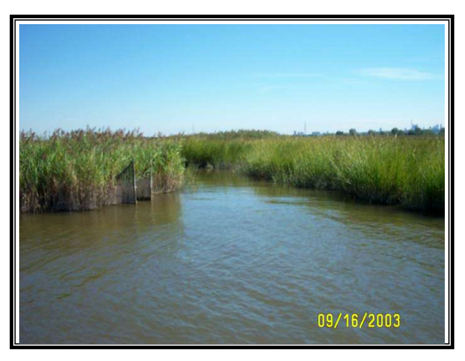
View showing mouth of main channel of Sawmill Creek Wildlife Management Area. Sample SAW-SD-001 taken along east side of channel.