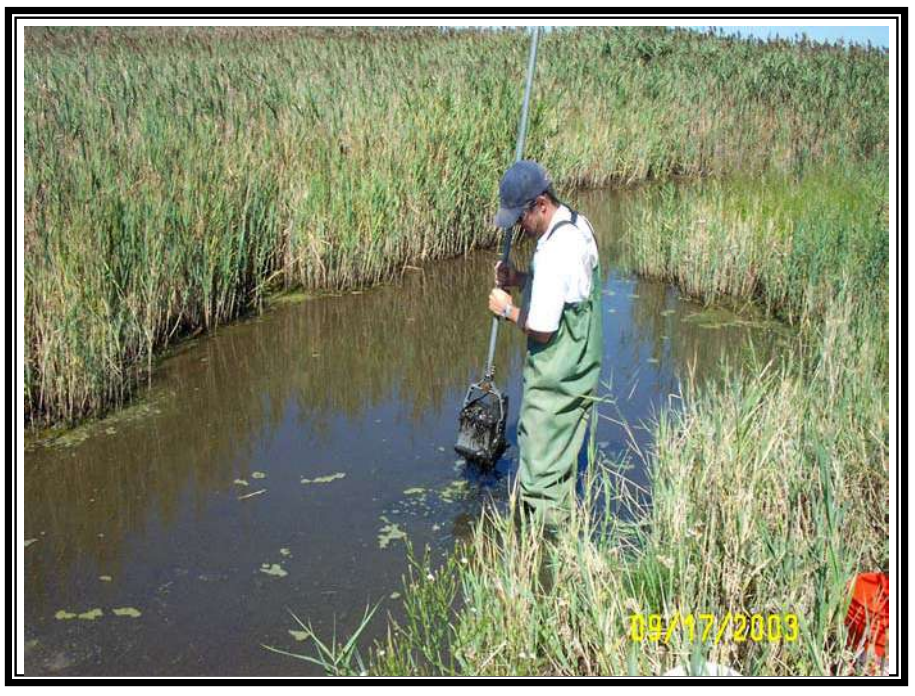
Photo 10: View facing east showing Oritani Marsh Sampling Site OM-SD-002 in a salt panne surrounded by Phragmites and an ENSR scientist extracting the Eckman with a sediment sample.