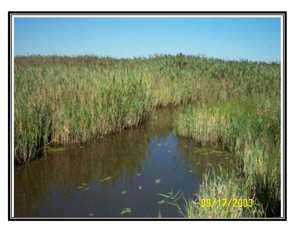
Photo 9: View facing east from railroad tracks showing Oritani Marsh Sampling Site OM-SD-001.