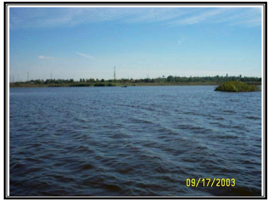
Photo 17: View facing southeast of Kearny Freshwater Marsh with sunken Ford Explorer.