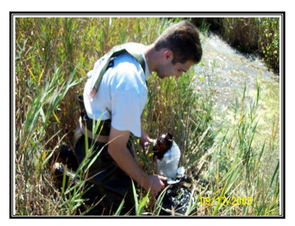
Photo 12: View of ENSR scientist dispensing sample for Accutest from a stainless steel bowl with a stainless steel spoon to an 8 ounce amber jar.