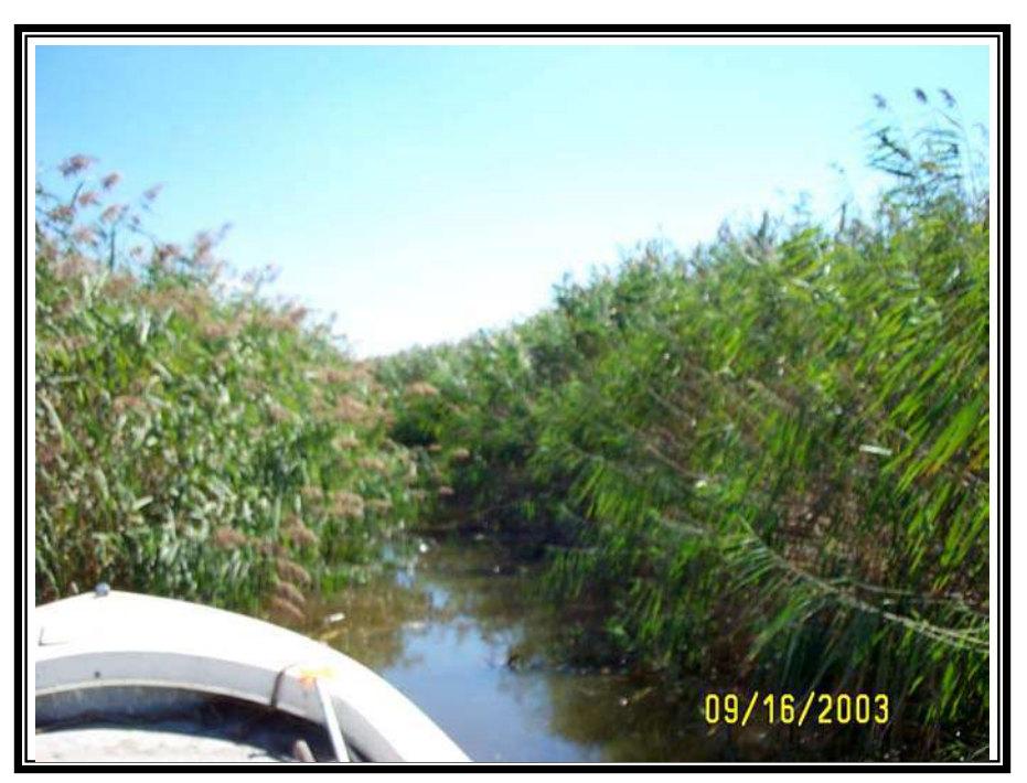
Photo 6: View facing east towards overgrown banks of ditch heading into the third sampling site.