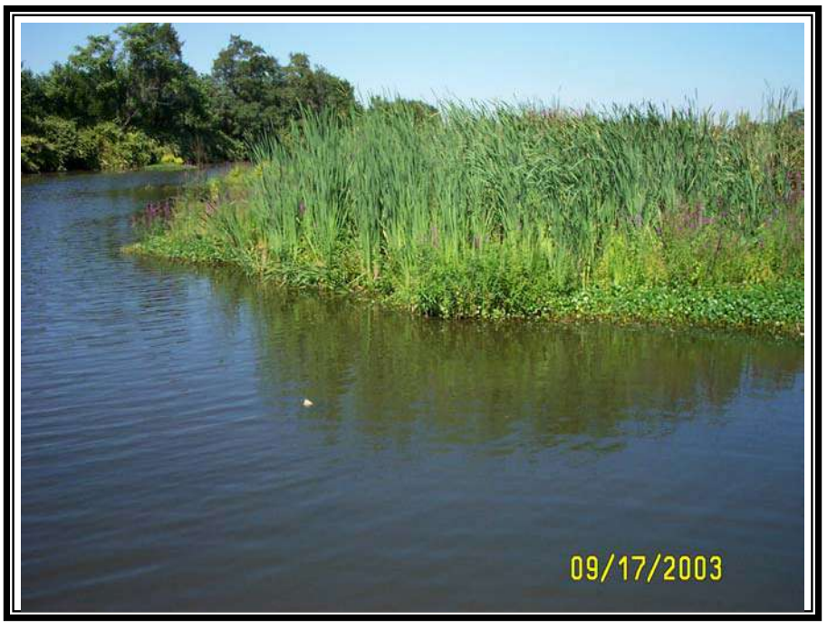
Photo 13: View facing north of Kearny Freshwater Marsh Sampling Site KM-SD-001 with purple loosestrife ( Lythrum salicaria ) and broad-leaved cattail ( Typha latifolia ) in the background.