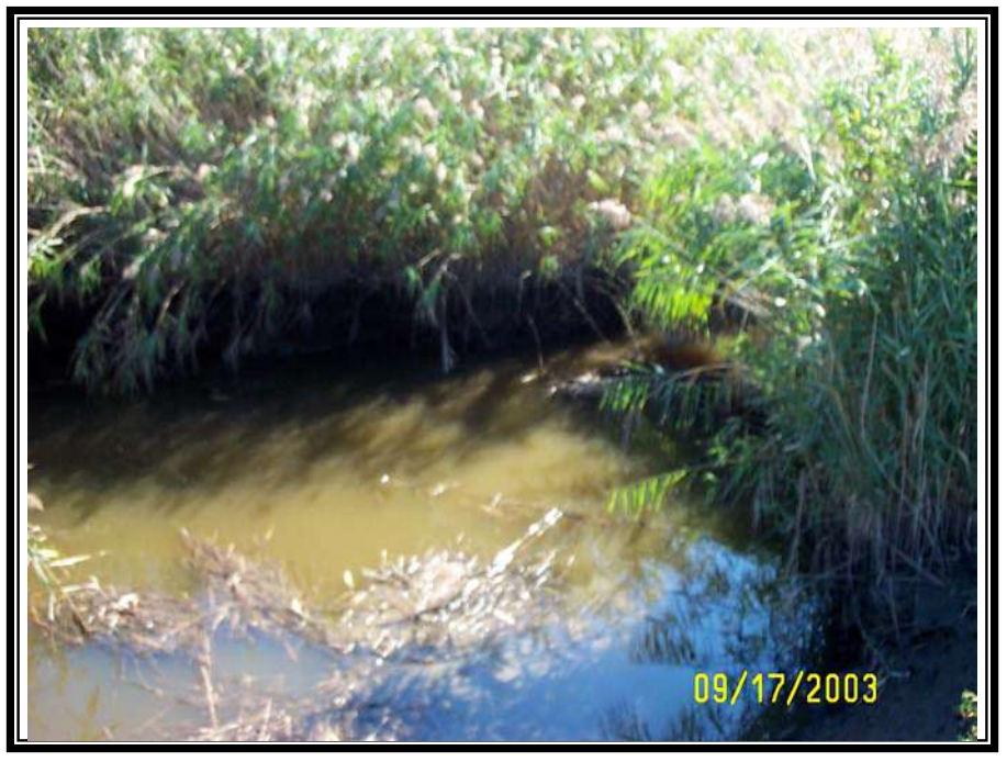
Photo 8: View showing Oritani Marsh Sampling Site OM-SD-001, a tidal creek surrounded by thickly growing Phragmites .