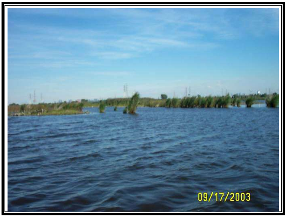
Photo 15: View facing east showing open water at Kearny Freshwater Marsh with islands of Phragmites in background.